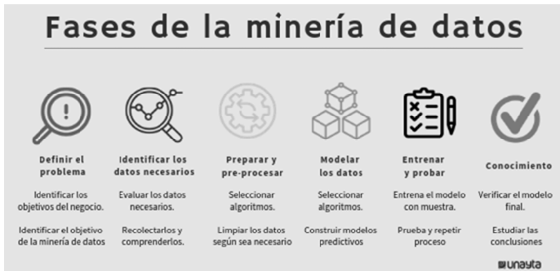
Figure 3. Phases of the mining of information.

To the moment to speak about the phases of the byline mining, we allude to the cycle of life of the same one, each of the steps that are applied for the correct development of this process, the relation in each of the areas that are worked and the specification of every process [57]. It performs big importance to know and to understand each of these processes that they will be highlighted, since this was helping us to fulfill all the requests necessary for the development of mining of information.